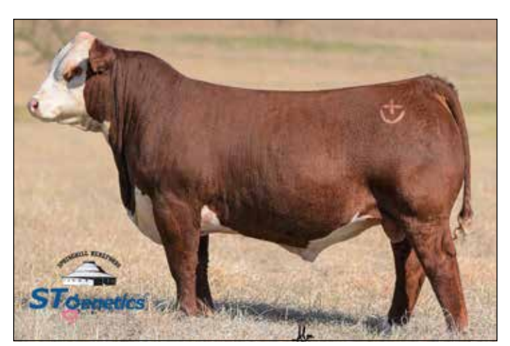
SHF HOUSTON D287 H086 Sire of Lots 16-23, 41-43 and 91-92.