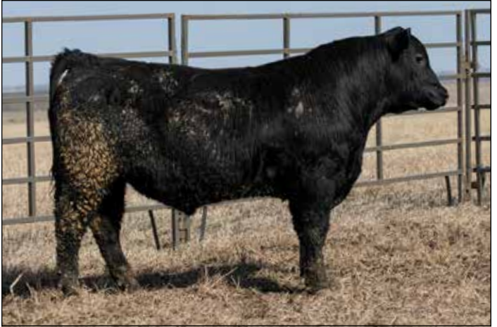
Lot 55: ALCOVE REGIMENT 311