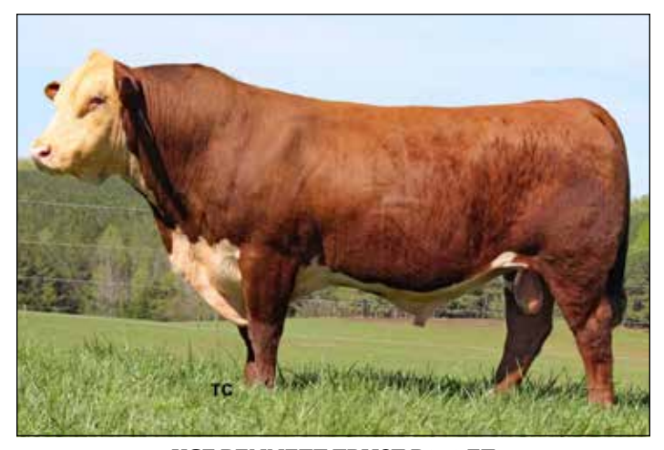
KCF BENNETT TRUST B279 ET Sire of Lots 28-31