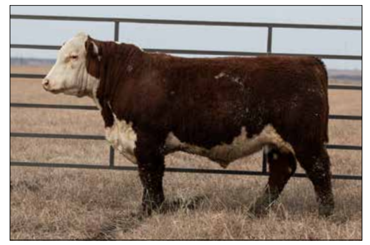
Lot 8: SH/DD FREEDOM K718