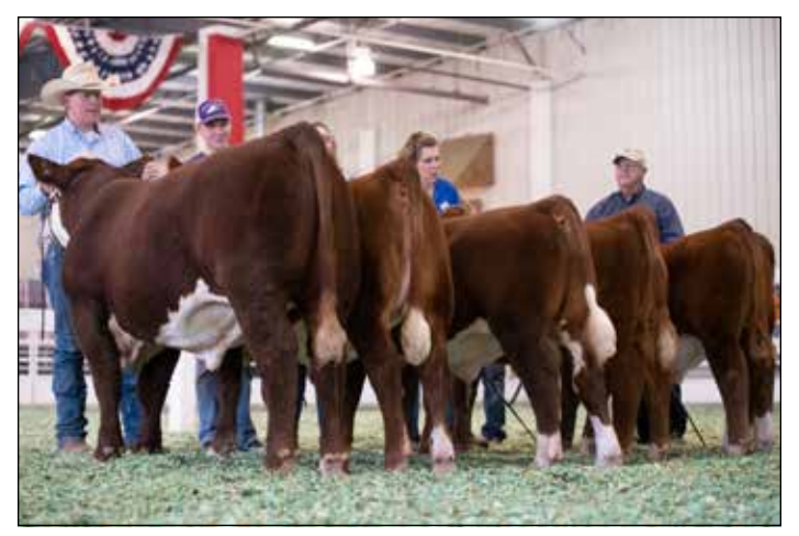
2023 Kansas State Fair Champion Best 6 Head