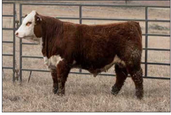
Lot 19: SH/DD HOUSTON L777

Homozygous Polled • This dark-red Houston son brings extra extension in a stout, deep-made package. When studying him you appreciate the length of hip he provides. He is in the top 15% of the breed for CHB$ and for both REA and Marbling. Pigment RE 75 - LE 100