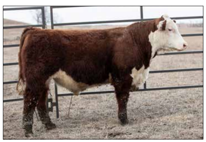
Lot 36: SH DURANGO 44U L843

This clean made SH Keystone son has a lot of natural thickness. He is big-footed with lots of style. Scurred.