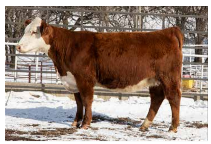
Lot 101: SH/WD CUTIE MIGHTY K594

Homozygous Polled • Due to calve 03/02/24: sired by SH KEYSTONE H185 (44146943)