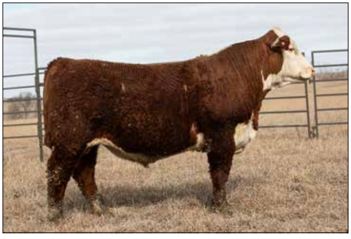
Lot 2: SH HOUSTON K701 ET