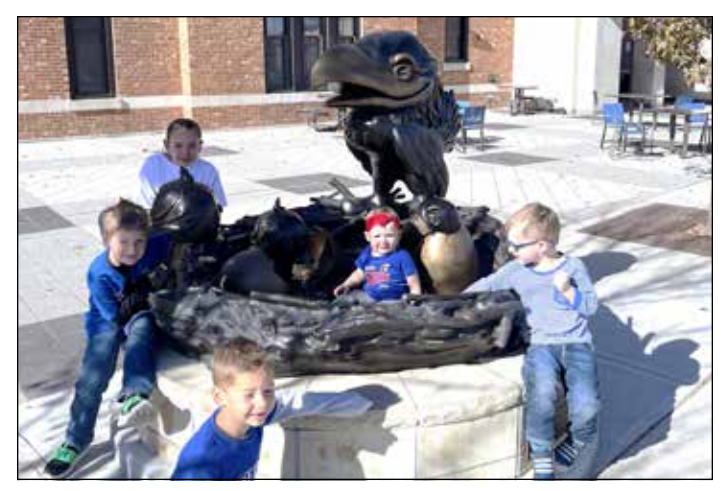
Grandkids attending KU football game.

Dam of this bull is a Pathfinder. Ranks in top 4% for docility. He is sired by Herbster Governor 962 and expresses his qualities of muscle shape, extra size, length of body and style.