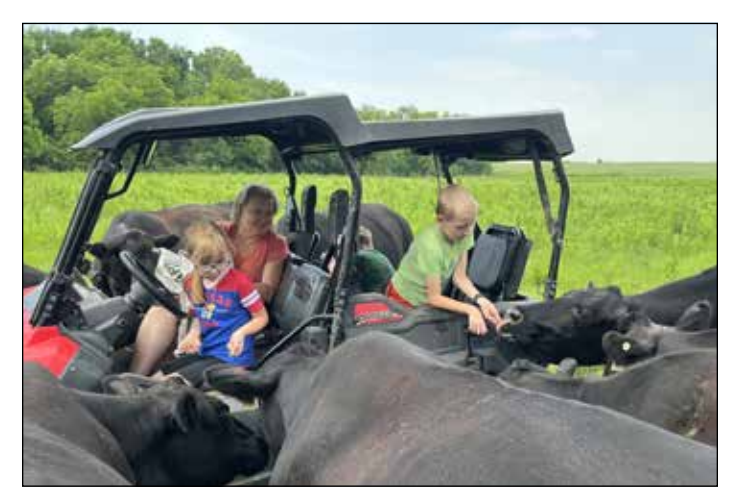
Grandkids feeding cattle.

Calving Ease Bull. CED of 12. Ranks in top 10% for CED and top 15% for WN and YW. Here is a bull that is sound, has calving ease and growth with a very complete profile.