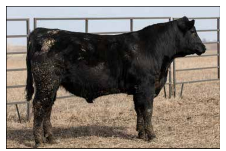
Lot 52: ALCOVE TRANSCENDENT 310