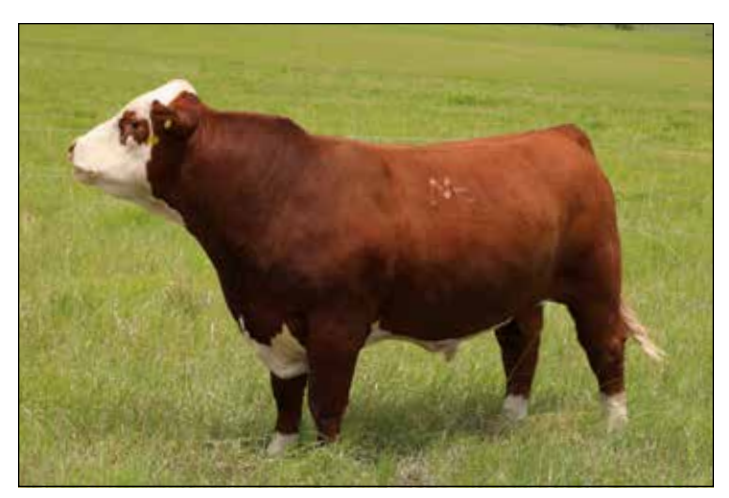
BIRDWELL WALL STREET 0588ET Sire of Lots 9-13