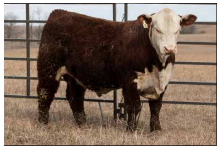
Lot 7: SH HUTTON 617 K711 ET

This red-necked, dark-red Houston son brings the lightest birthweight of this fall sire group. He is a moderate-framed bull that is bold-made, easy-traveling, long-sided that brings all that together in a thick-made package. Pigment RE 80 - LE 100