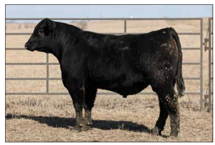
Lot 68: ALCOVE OPTIMUM 326