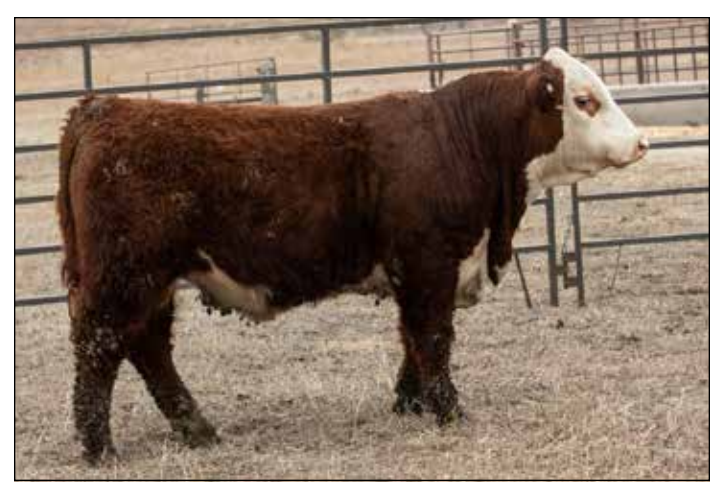
Lot 32: SH LONG HAUL L097