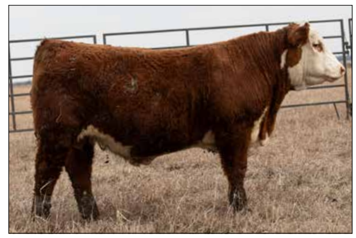
Lot 27: SH/WD 2504 MANDATE L860

SH/CF DEFIANCE L750 Reg #: 44464247 DOB: 2/02/23 LOEWEN GENESIS G16 ET [CHB] LOEWEN DCF DEFIANCE H49 ET LOEWEN MISS 994W 6X 7C TH 122 71I VICTOR 719T [SOD] SH 719T PRETTY ONE G940