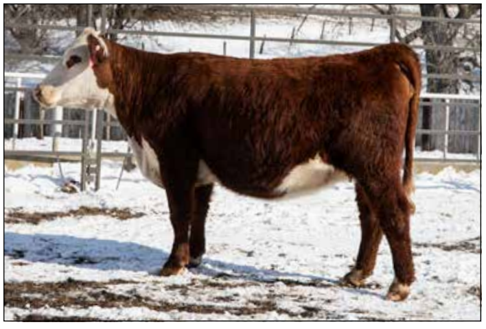
Lot 92: SH/G AMANDA HOUSTON K665

Homozygous polled • Bull calf at side sired by KCF BENNETT RESOLVE G595 (44105347) born Jan 25 and weighed 70 lbs.