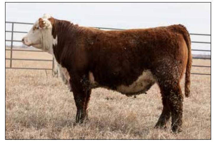
Lot 14: SH HUTTON L765 ET