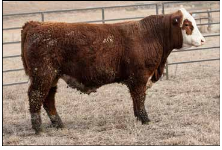
Lot 10: SH/DD WALL STREET L767

Homozygous Polled • Our highest CE to YW spread Wall Street son! This is a bold-made, long-sided, easy-traveling, expressive-hipped bull who puts the performance together in a stylish package. We selected Wall Street for his performance and he did not disappoint. Pigment RE 100 - LE 50