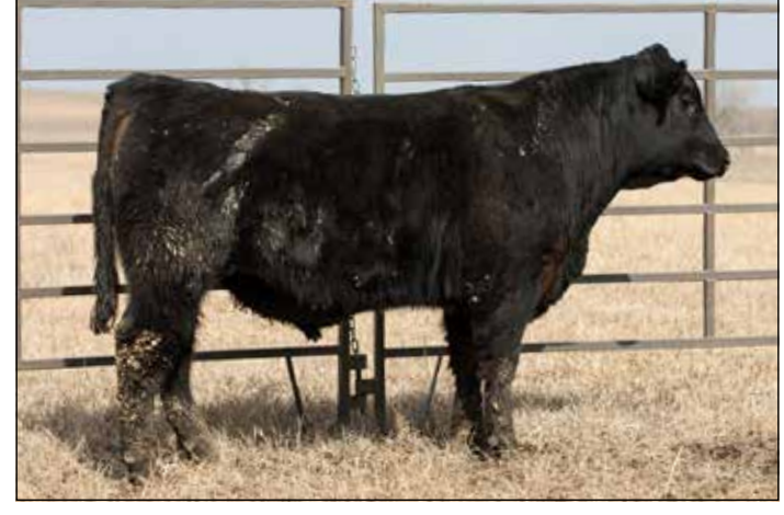
Lot 73: ALCOVE ASHLAND 354