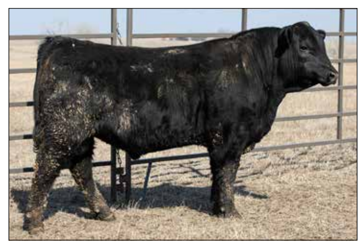
Lot 62: ALCOVE JET BLACK 338