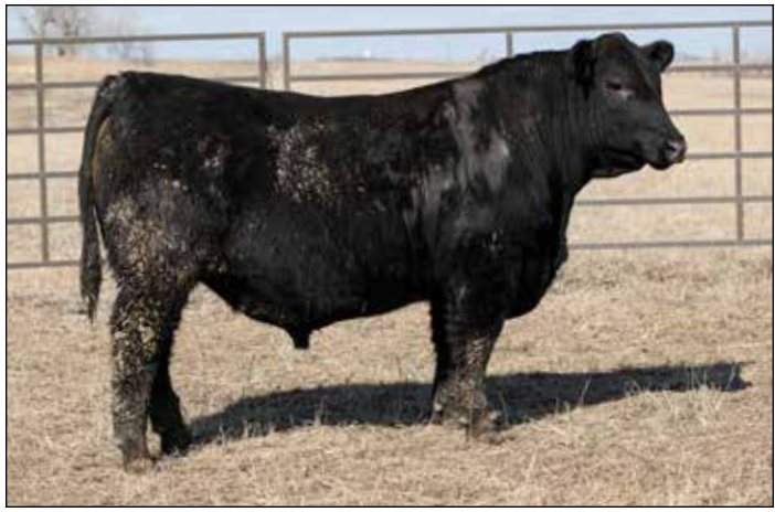
Lot 53: ALCOVE ICONIC 321