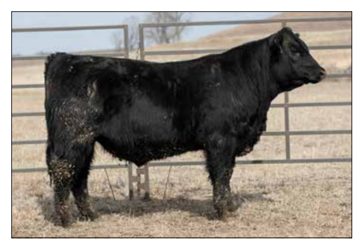
Lot 77: Alcove Governor 360