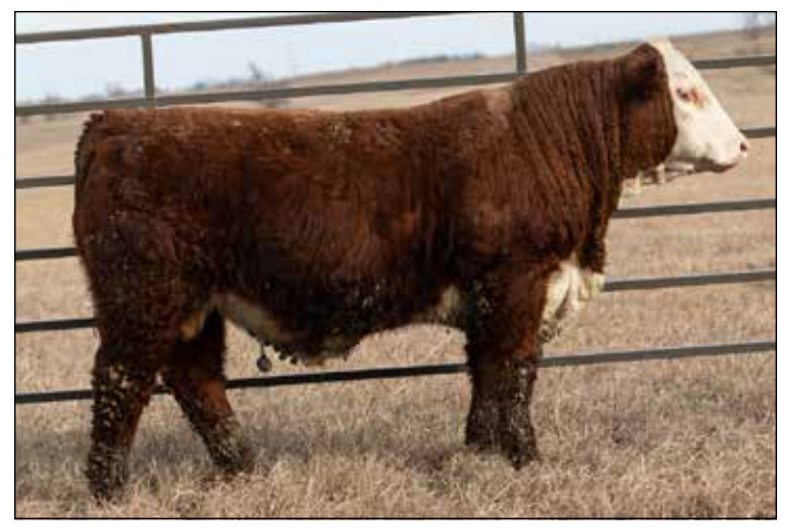
Lot 17: SH/DD HOUSTON L742