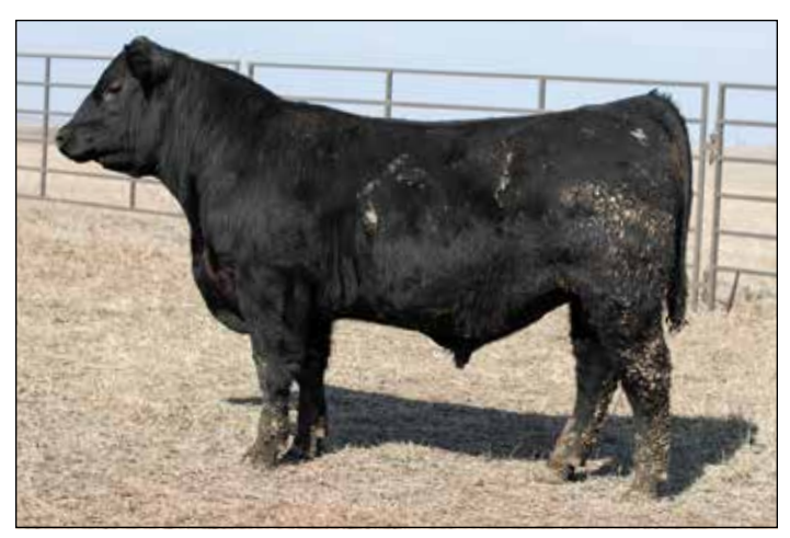
Lot 56: ALCOVE IRON HORSE 306

Calving Ease Bull. Ranks in top 2% for $W, top 4% CED, top 10% BW, WN, and docility. With an actual birth weight of 65 pounds look no further than him for your next heifer bull.