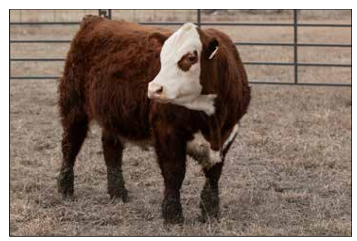
Lot 13: SH WALL STREET L873

Homozygous Polled • Wall Street can sure put pigment on his offspring, this goggled-eyed, dark-red bull captures that well. In addition to his depth of body, moderate frame and powerful hip; he ranks in the top 10% for his BMI $ value. Pigment RE 100 - LE 100