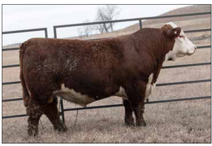
Lot 1: SH PERFECT H282 K686