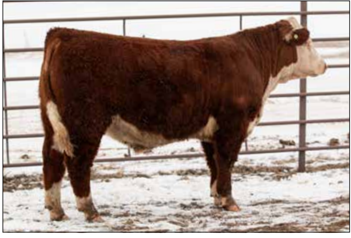
Lot 9: SH/WD WALL STREET L744