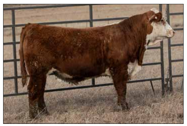
Lot 24: SH/CF DEFIANCE L750