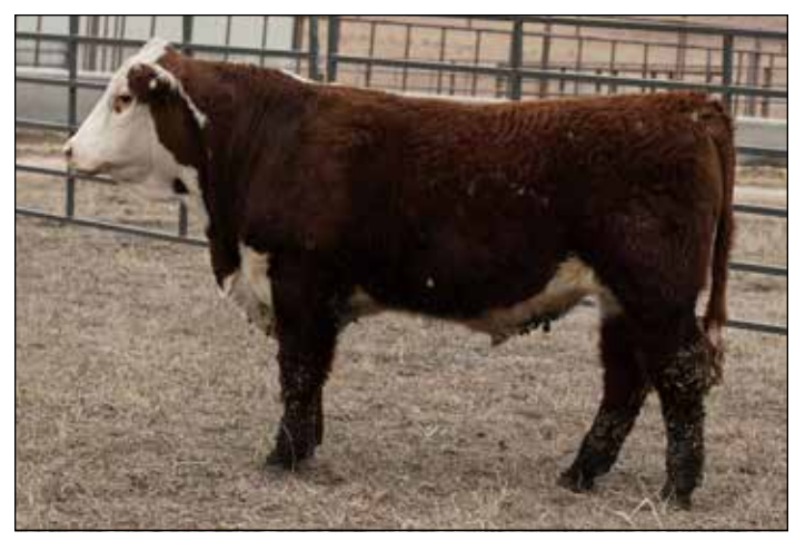
Lot 30: SH BENNETT TRUST L810