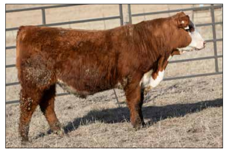
Lot 34: SH LEADER 182F L791

A stout, thick-made 182F son. Clean fronted. Top 15% in WW and YW EPDs that will add pounds to your next calf crop.