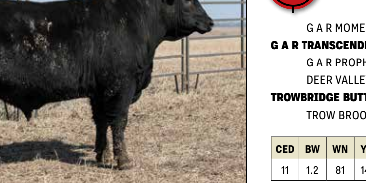
Lot 51: ALCOVE TRANSCENDENT 302