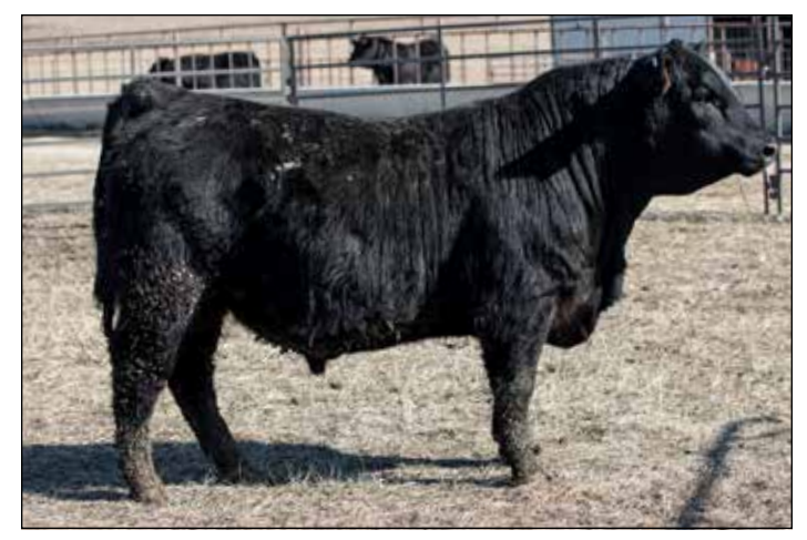
Lot 65: ALCOVE OPTIMUM 309

Calving Ease Bull. A thick, heavy-muscled, rancher's type bull. He'll add pounds to the bottom line.