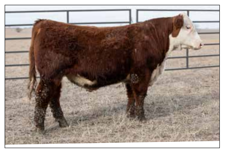
Lot 33: SH LEADER 182F L806