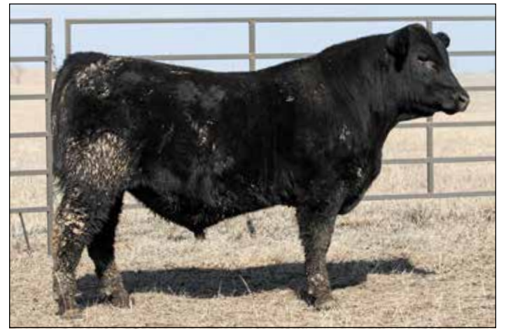
Lot 54: ALCOVE ICONIC 303