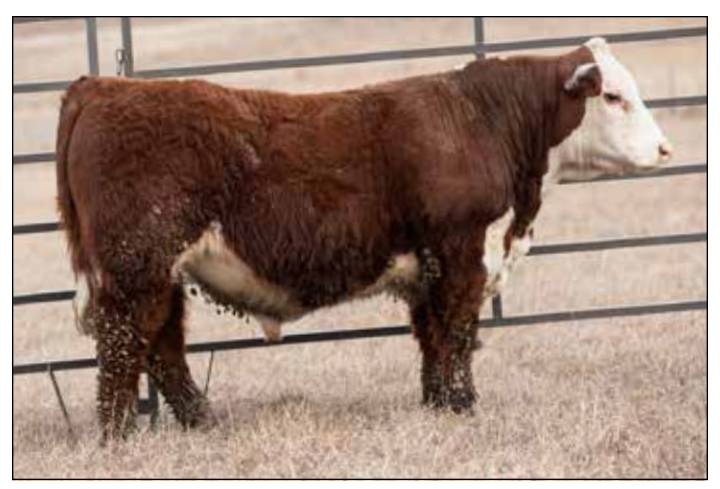
Lot 16: SH/LS HOUSTON L732