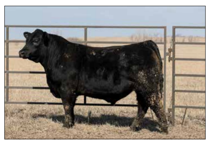
Lot 69: ALCOVE TRAILBLAZER 327