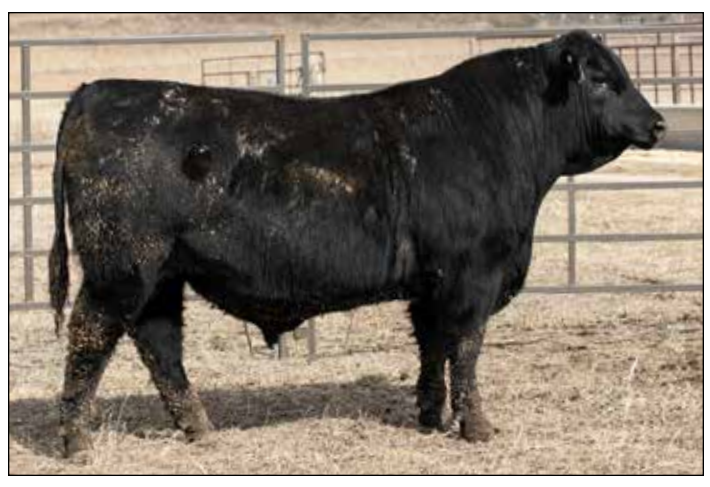
Lot 50: ALCOVE TRANSCENDENT 304