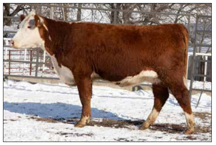
Lot 93: SH MS MAJESTIC K540

Homozygous Polled • Bull calf at side sired by NJW LONG HAUL 36E ET (43829326) born Feb 06 and weighed 82 lbs.